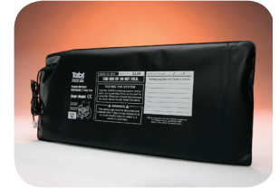
Bed and Chair Pads