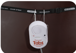
Side Chair Attachment